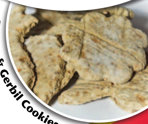
Bunny & Gerbil Cookies