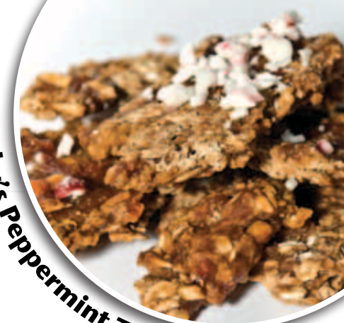
Lucky's Peppermint Treats