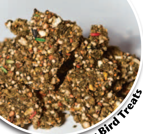
Sweet Honey Bird Treats